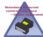
Standard external control interface --Order separately